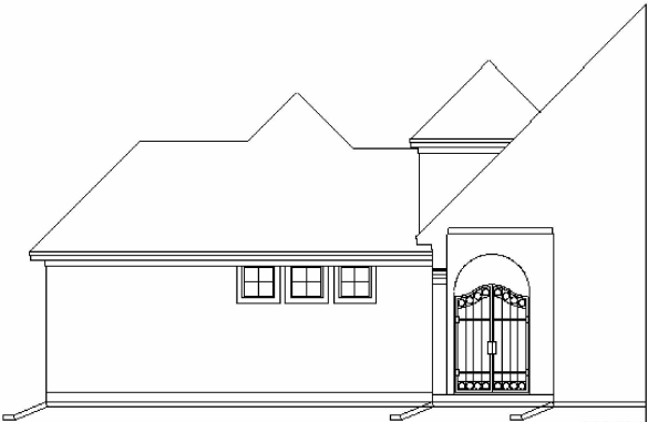
REAR COURTYARD ELEVATION